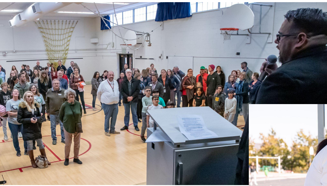
Fly Over at Community Event